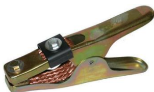
Arc welding plate clamp