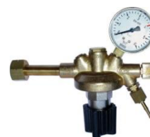
Propan pressure regulator