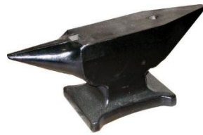
Forged iron anvil