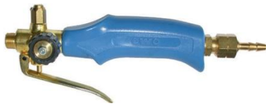
Propane gas fitting