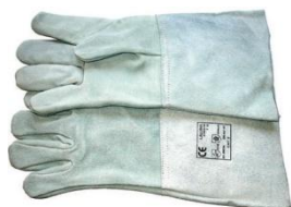
Crust leather protective gloves