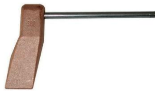
Copper welding hammer