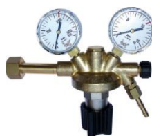
Oxygene pressure regulator