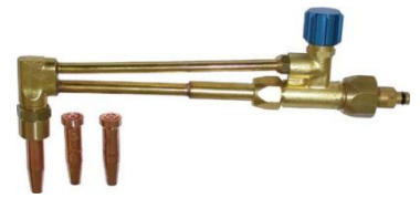
Prof. tool for welding & cutting