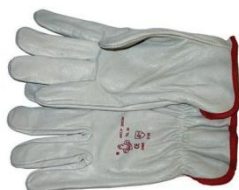
Grain leather protective gloves