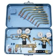
Welding and cutting tool set