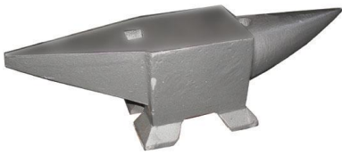
Moulded cast iron anvil