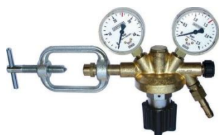
Acetylene pressure regulator