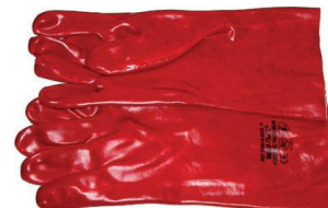
Water-proof PVC gloves