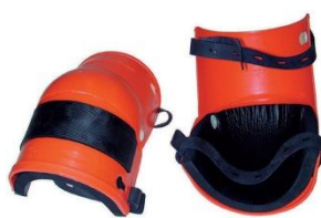
Protection for knee