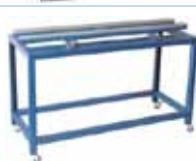
Rail bed MOD.6030