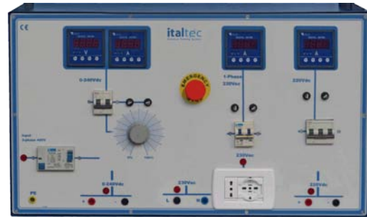
Mod.6004D -DC power supply (Digital)