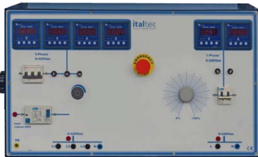
Mod.6002D 3-Ph/1Ph AC power supply(Digital)

DC variable output: 0÷230V, 3A with - 1 x D.C. voltmeter - 1 x D.C. ammeter D.C. fixed output: 220V, 10A - with 1 x D.C. ammeter Single phase triple output: fixed 230Vac 16A - 1 x A.C. ammeter