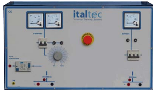
Mod.6004-03-15 -DC power supply

3 phase adjustable output: 0÷450V, 10A with - 1 x A.C. voltmeter - 3 x A.C. ammeters Single phase adjustable output: 0÷240V 15A with - 1 x A.C. voltmeter - 1 x A.C. ammeter