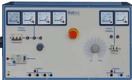
Mod.6002-10-15 3-Ph AC power supply 10+15A

3 phase adjustable output: 0÷450V, 10A with - 1 x A.C. voltmeter - 3 x A.C. ammeters Single phase adjustable output: 0÷240V 15A with - 1 x A.C. voltmeter - 1 x A.C. ammeter