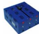
Starting rheostat MOD.3011